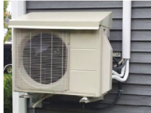
Proper placement: on brackets, insulated tubing, rigid line cover, wind baffle.