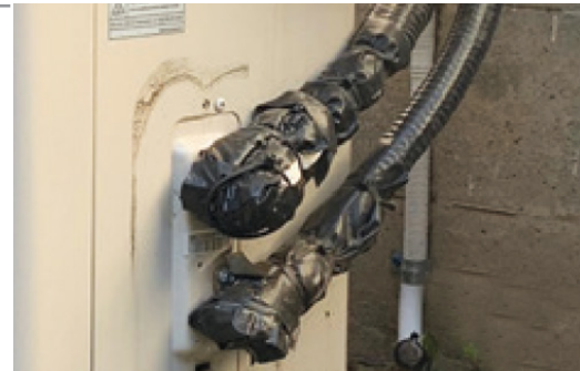
Ensure that the insulation is thorough and covers the entire line set, as shown here.