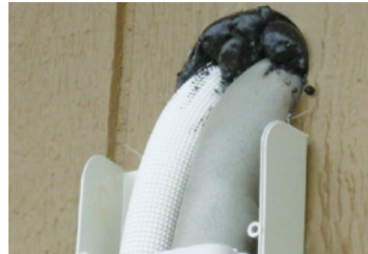
Be sure to air seal all wall penetrations.