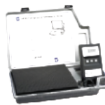
PROGRAMMABLE REFRIGERANT CHARGING SCALE