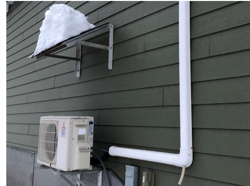
Proper outdoor placement, showcasing a drip cap/snow shield.