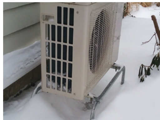
Equipment stand: keeping the unit above the snow (to some degree).