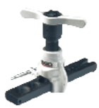
RATCHET FLARING TOOL

REQUIRED TOOLS: Ratchet flaring tool, programmable refrigerant charging scale, torque wrench, R401A gauge and hose set, vacuum pump (not pictured), flare gauge (not pictured)